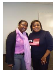
First Transit Recruitment