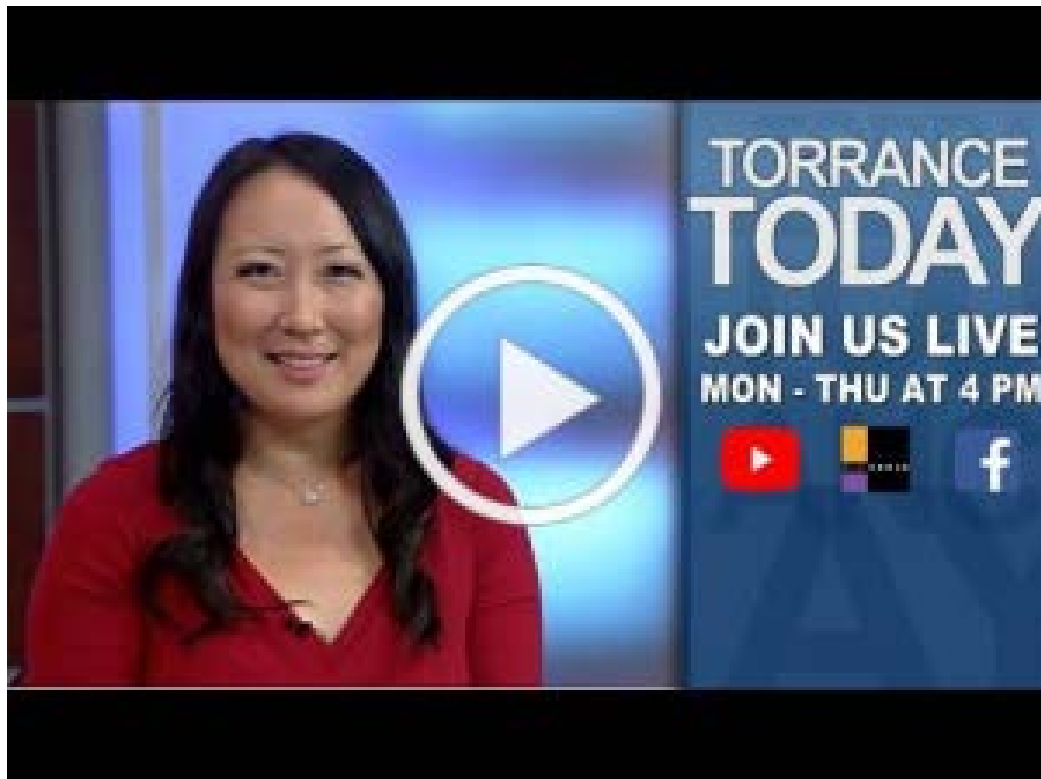
27th Annual Awards Ceremony Torrance CitiCABLE News Coverage