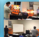
Electrical Wiring Technician Training