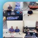
Job Placement Assistance

Thank you to the South Bay WIB for supporting our community.